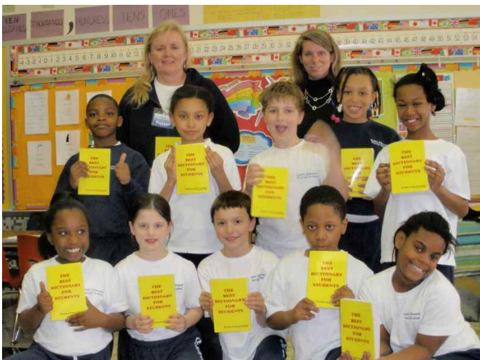
St. Edmund's School.